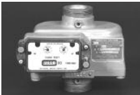
Figure 2 - Odometer Index

Two index options are available. The customer specifies the dial or odometer index when ordering the meter. Readings are in ACFH (m 3 /h).