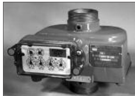
Figure 3 - Dial Index

Insure the impellers turn freely and no objects or contaminants are in the measuring chamber.